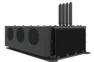
Optional enclosure for fan support