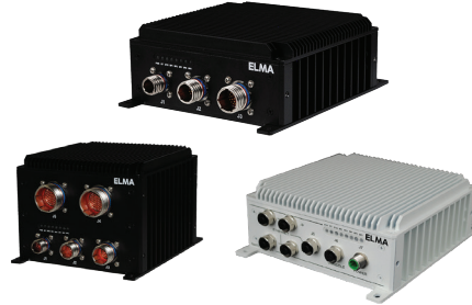
NetSys 5300 Family