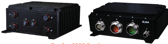
ComSys 5300 Family